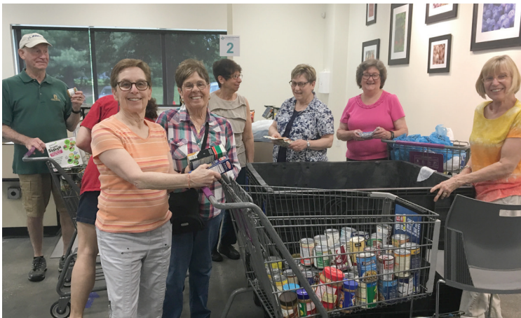
"Pay It Forward" Village Volunteer Team stocking the shelves at the Food Bank on Berger Road in Columbia.

TVIH is having a Halloween extravaganza on October 28 th called "Pasta, Players and Painters" which will include a silent auction to raise money for the Village. We are asking TVIH members who are willing to donate an item that they have created, whether it be a photograph, painting, knitted item, wood item or pottery, to contribute their work of art for the silent auction. If you have an item, please email Kathy O'Rourke ( k_orourke@verizon.net ) with a description and photo if available. Thanks for considering; we appreciate your talent and contribution.